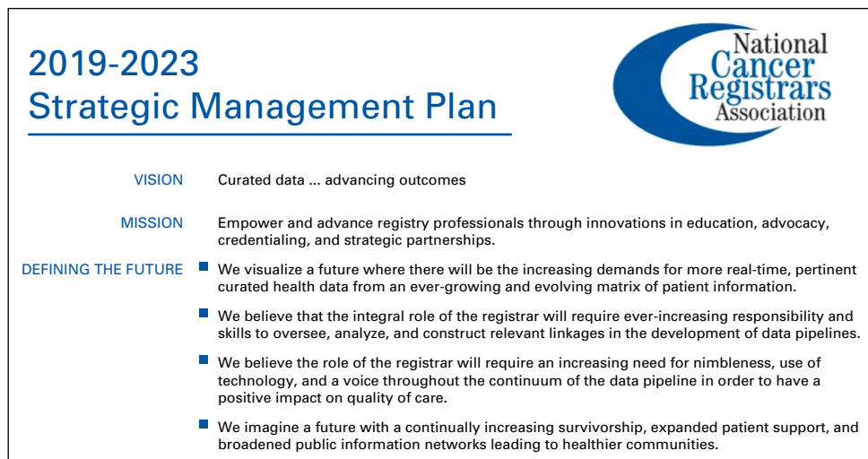
FIG 3. NCRA strategic management plan.

prepared to collaborate and generate high output and high-quality data to assist in the fight against cancer.